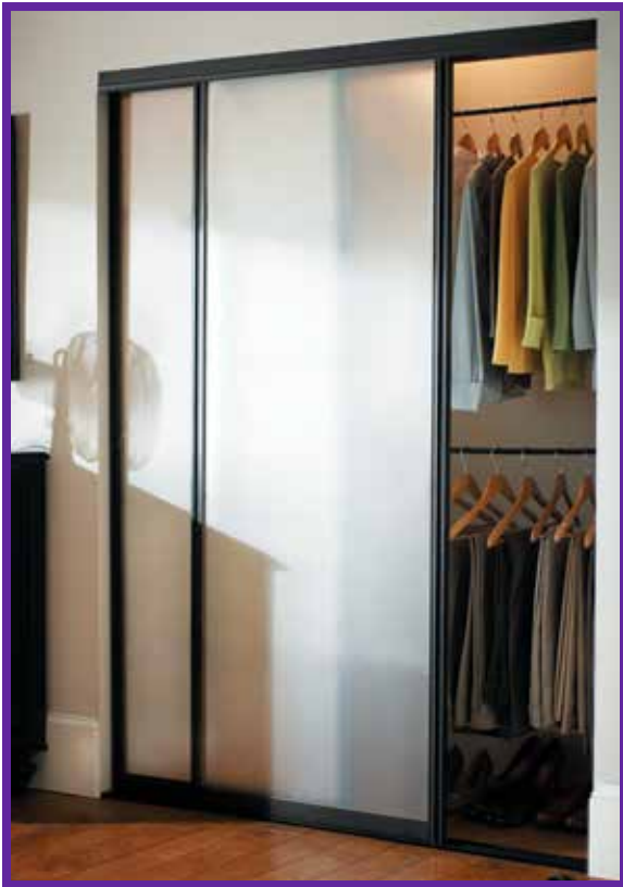
Pictured in a Bronze finish with Mystique™ Duratuf® tempered safety glass