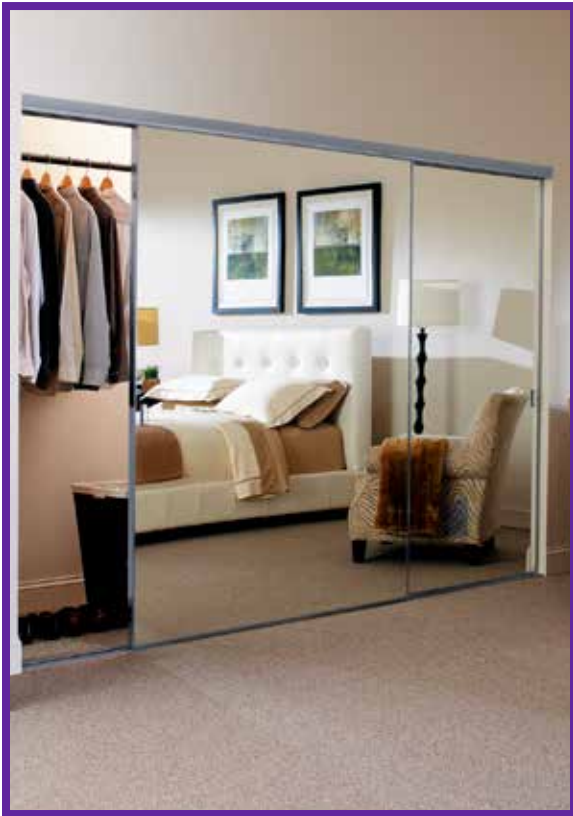
Pictured in a Satin Clear finish with Duraflect® copper-free mirror